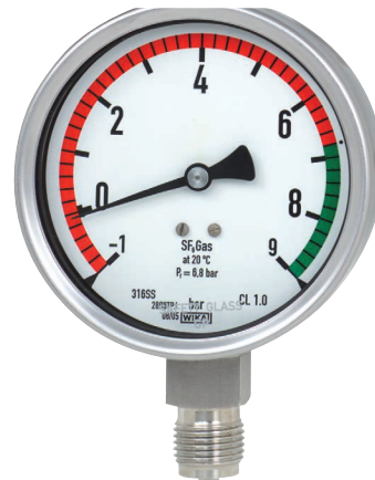
Gas density indicator model GDI-100