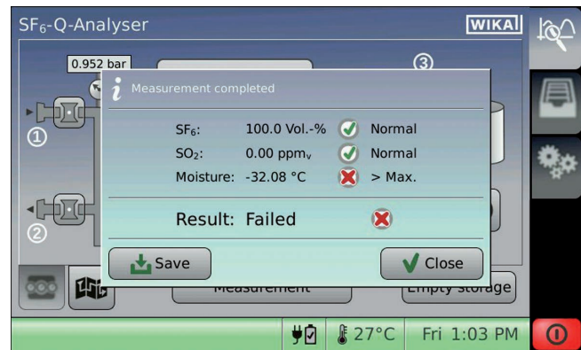
Measured value display

The GA11 makes it quick and easy to import a measuring point list, edited on a PC. Due to the complexity of the measurement task, specific knowledge is a pre-requisite, see IEC 62271-4:2013, ASTM D2029-97:2017 and CIGRÉ - SF 6 Measurement guide (723).