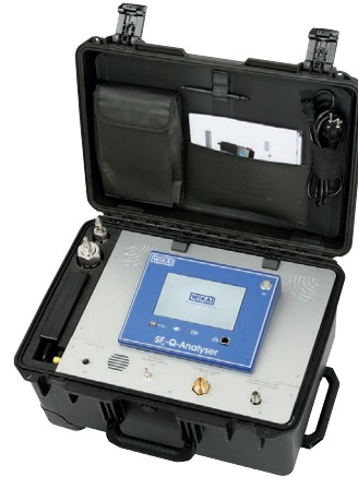
Analytic instrument model GA11